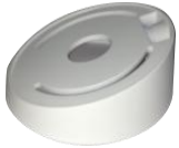
Inclined ceiling mount