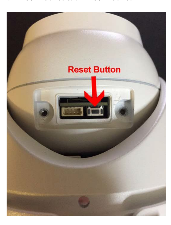
CMIP33** Series & CMIP38** Series